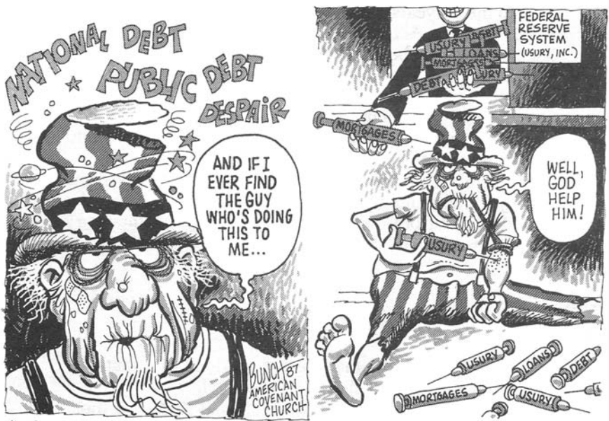
... for by thy (Mystery Babylon's) sorceries (druggery) were all nations deceived." Revelation 18:23