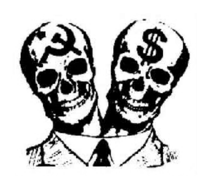
CAPITALISM -VS- SOCIALISM

Through statesanctioned media outlets, like TV and radio, hired messengers introduce opposing viewpoints to the public. These