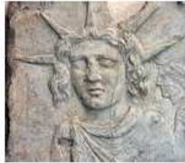
Mithra With Sun Rays