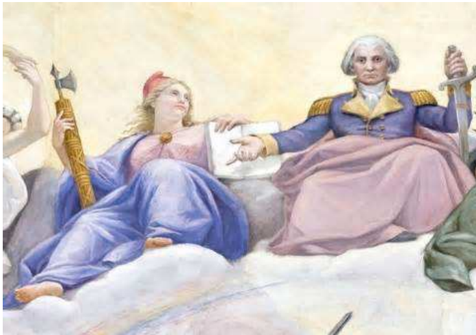
The Apotheosis Of Washington

the rotunda of the Capitol Building in Washington DC. On Washington's right is Columbia (Lady Liberty) wearing a Mithras Cap ("Liberty Cap") and holding a Roman Fasces in her right hand.