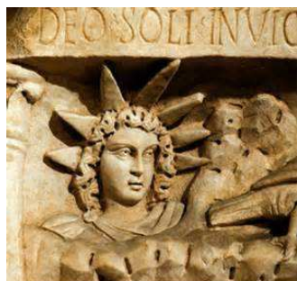
(Mithra: God Of The Unconquered Sun)

• Mithra is called a mediator. • Mithraism had a Eucharist. • The churches worship their