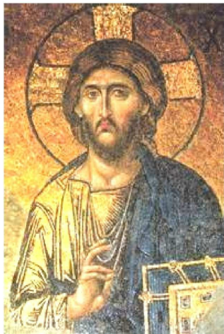
Mithra With Halo (sun rays)

The churches promote a false christ; a christ that reflects an ancient Persian god known as Mithra. When the church system was invented by the Roman emperor Constantine, he stole the title "Christ" and gave it to his god Mithra. Since then, Mithra (not the real Jesus) has been the christ taught by the churches ... including the Protestants who followed the Catholic church.