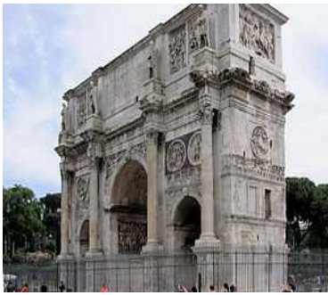
CONSTANTINE'S ARCH WITH MITHRA SCULPTURES

celebrate his triumph. The arch is most notably decorated with images of Mithra and the goddess Victoria (also called "Liberty" and "Columbia" in later paintings and sculptures of France and America ... like the painting of "The Apotheosis Of Washington" (i.e., George Washington ascending to heaven) on