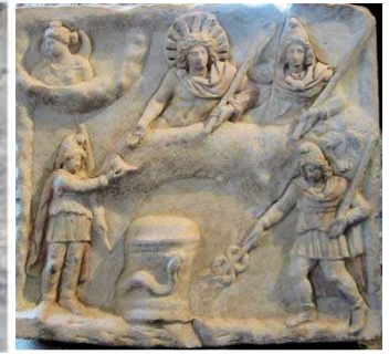
Mithra With Halo (see "Liberty Caps")

"Jesus" with a Sunrise Easter service (a Sun worship doctrine not found in the Bible ... except for a ceremony called "an abomination" in Ezekiel 8.